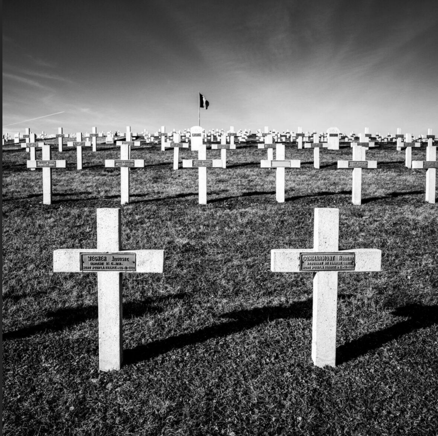
After the war