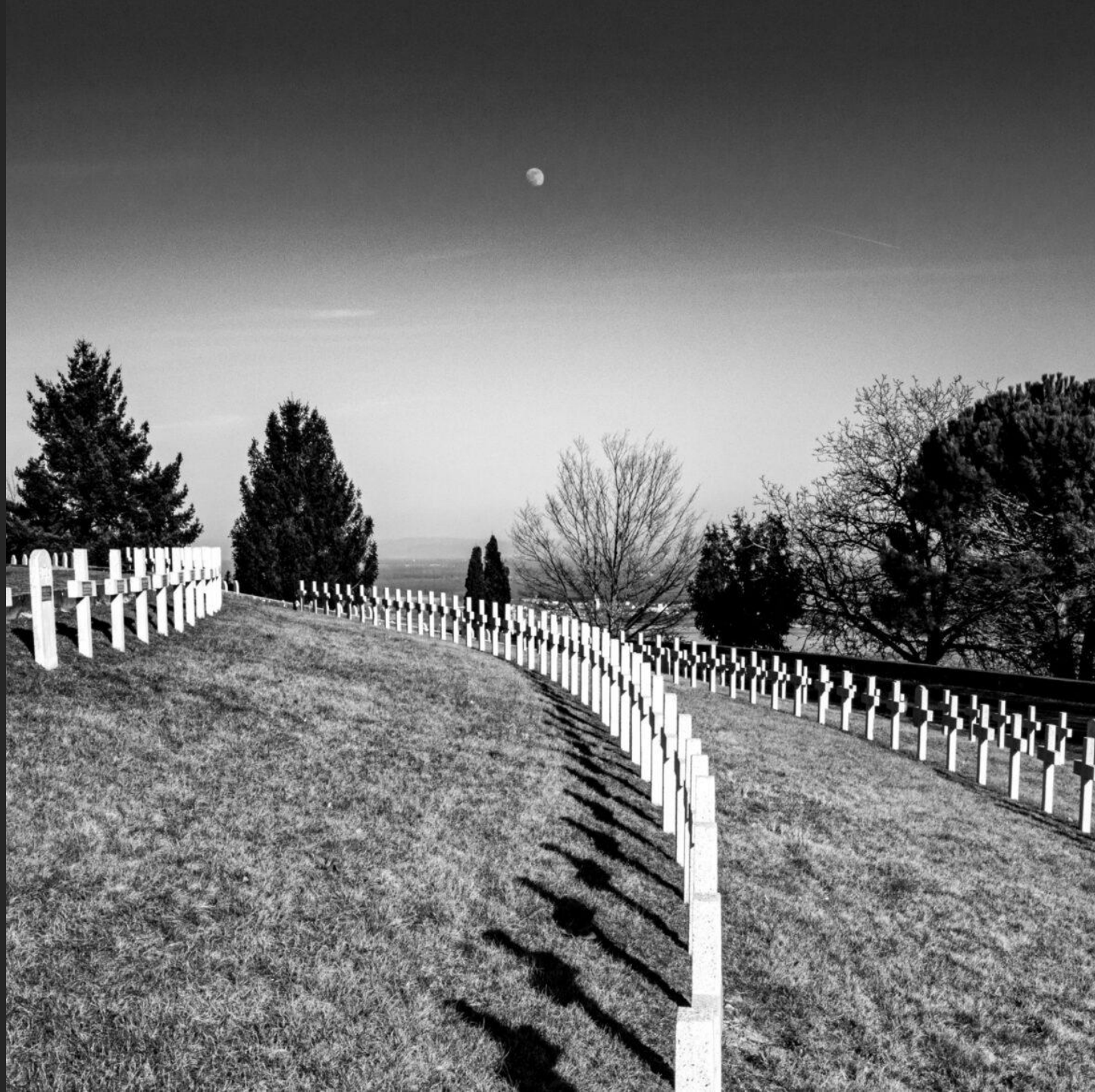
Moon over cemetery