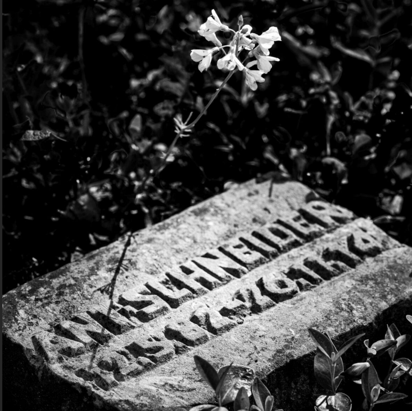
Flower watching over soldier Schneider