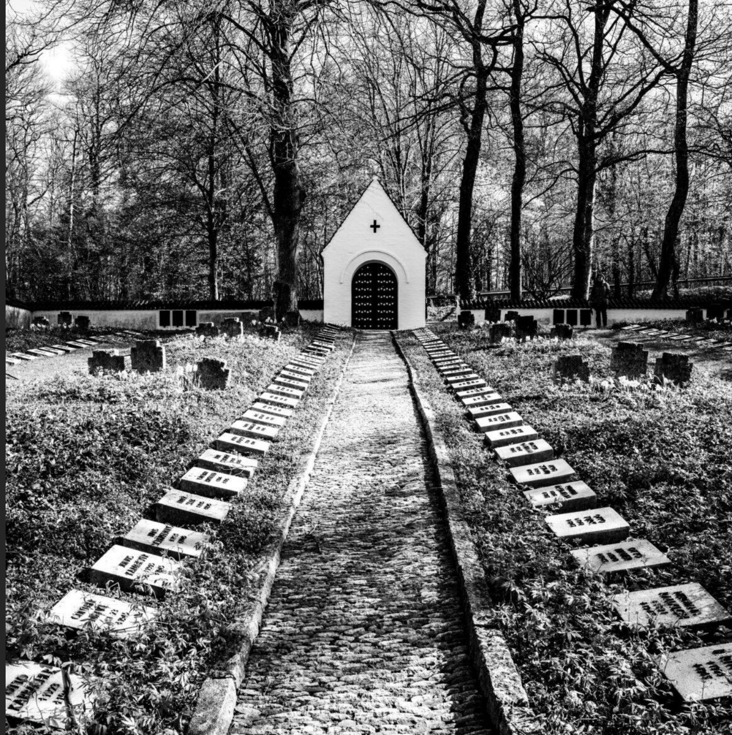
Chapel of war soldiers