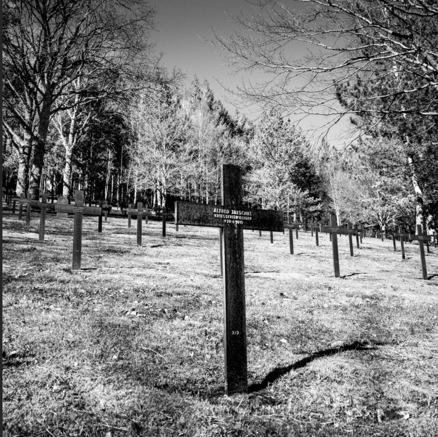
Final rest under trees