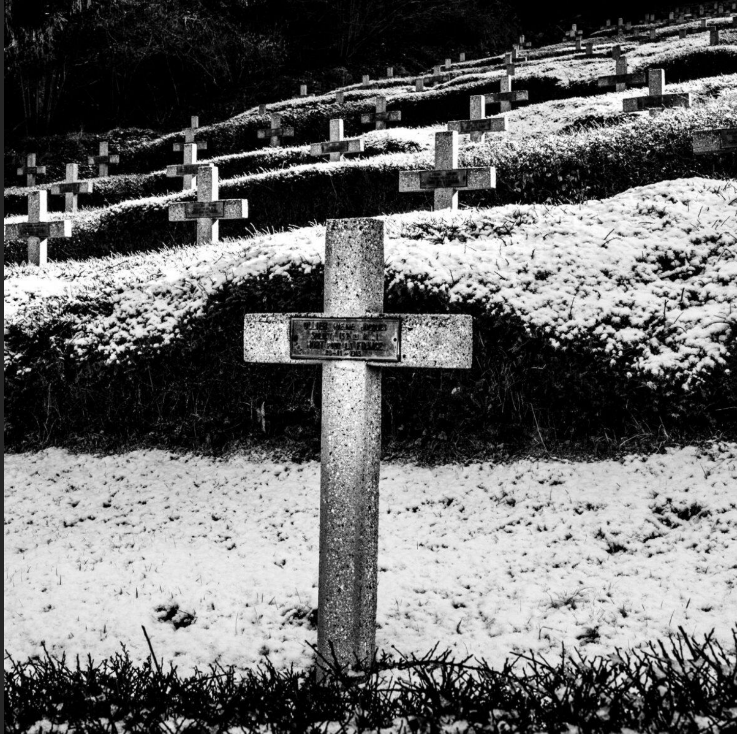
Waves of death