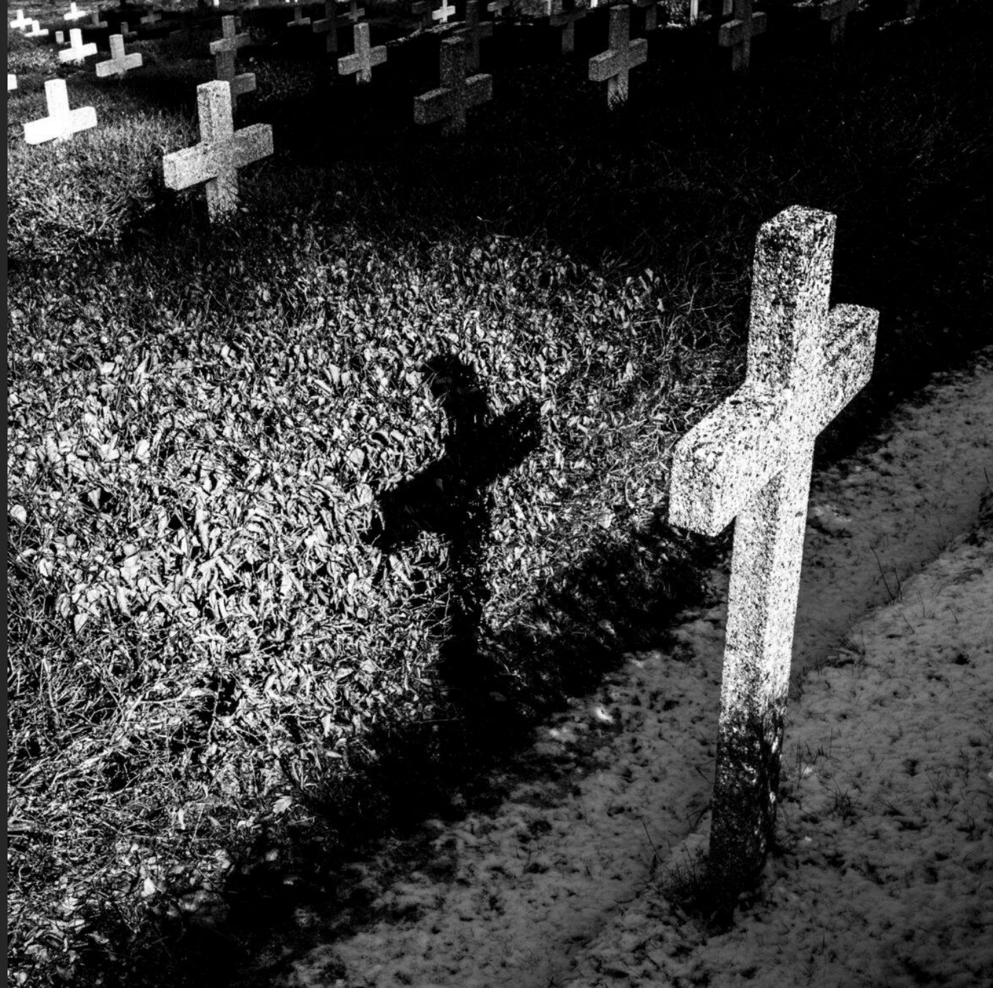
Shadow of death