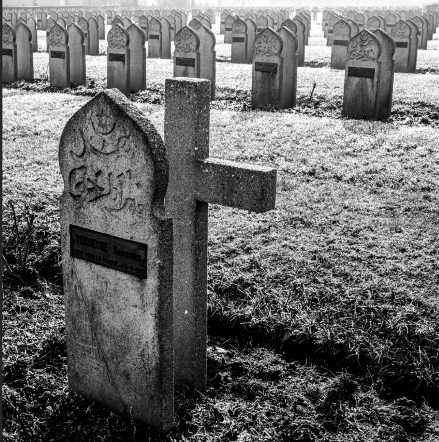
Two religions, one war