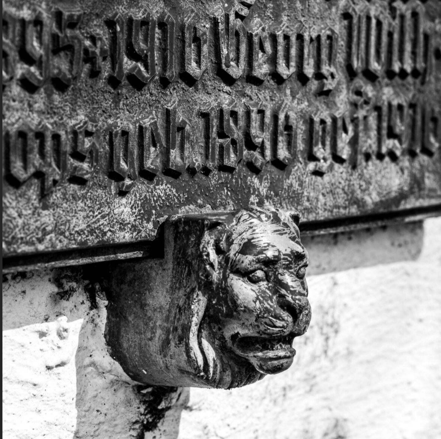
Lion of the fallen soldiers