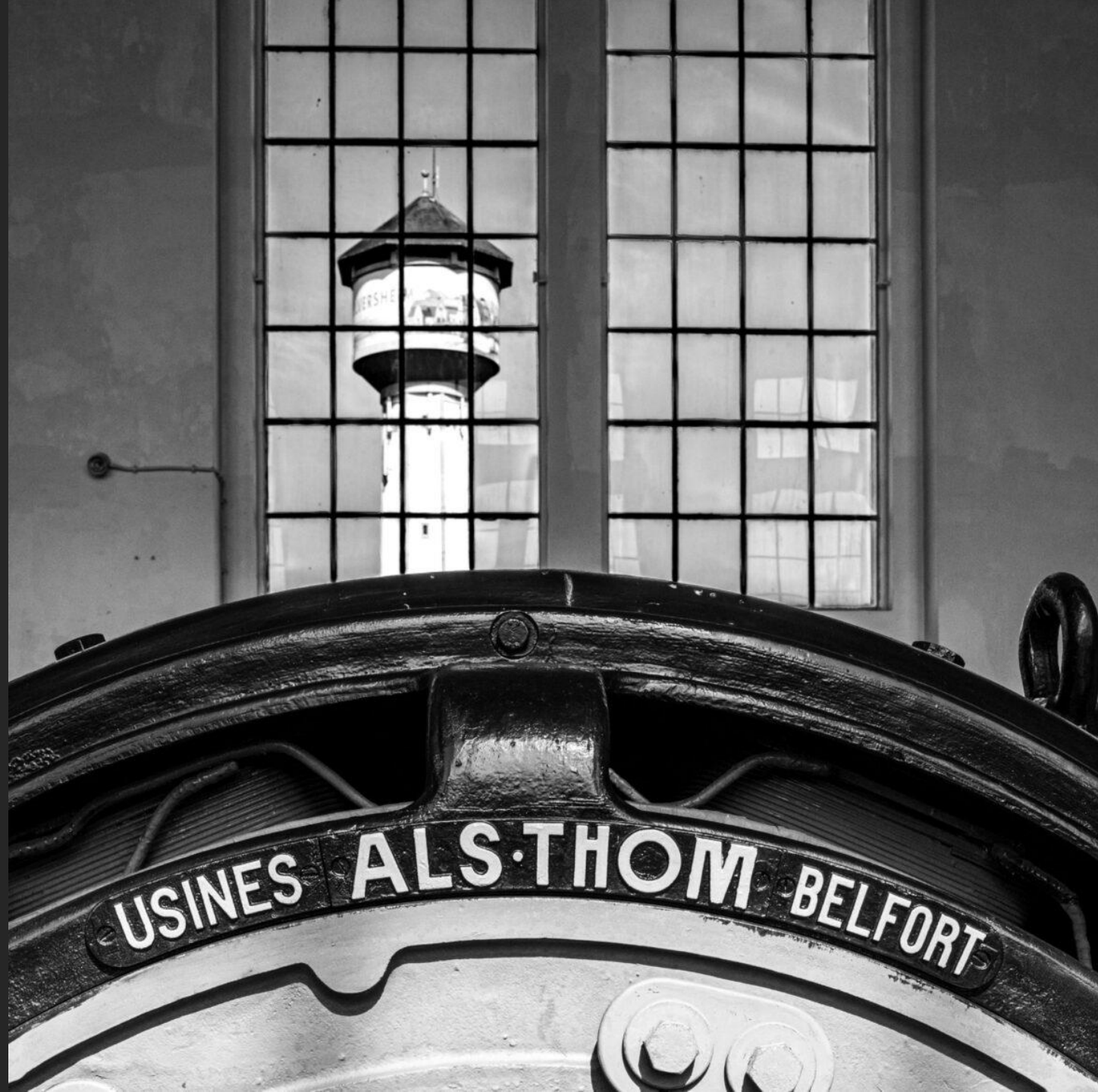
The origins of Alstom