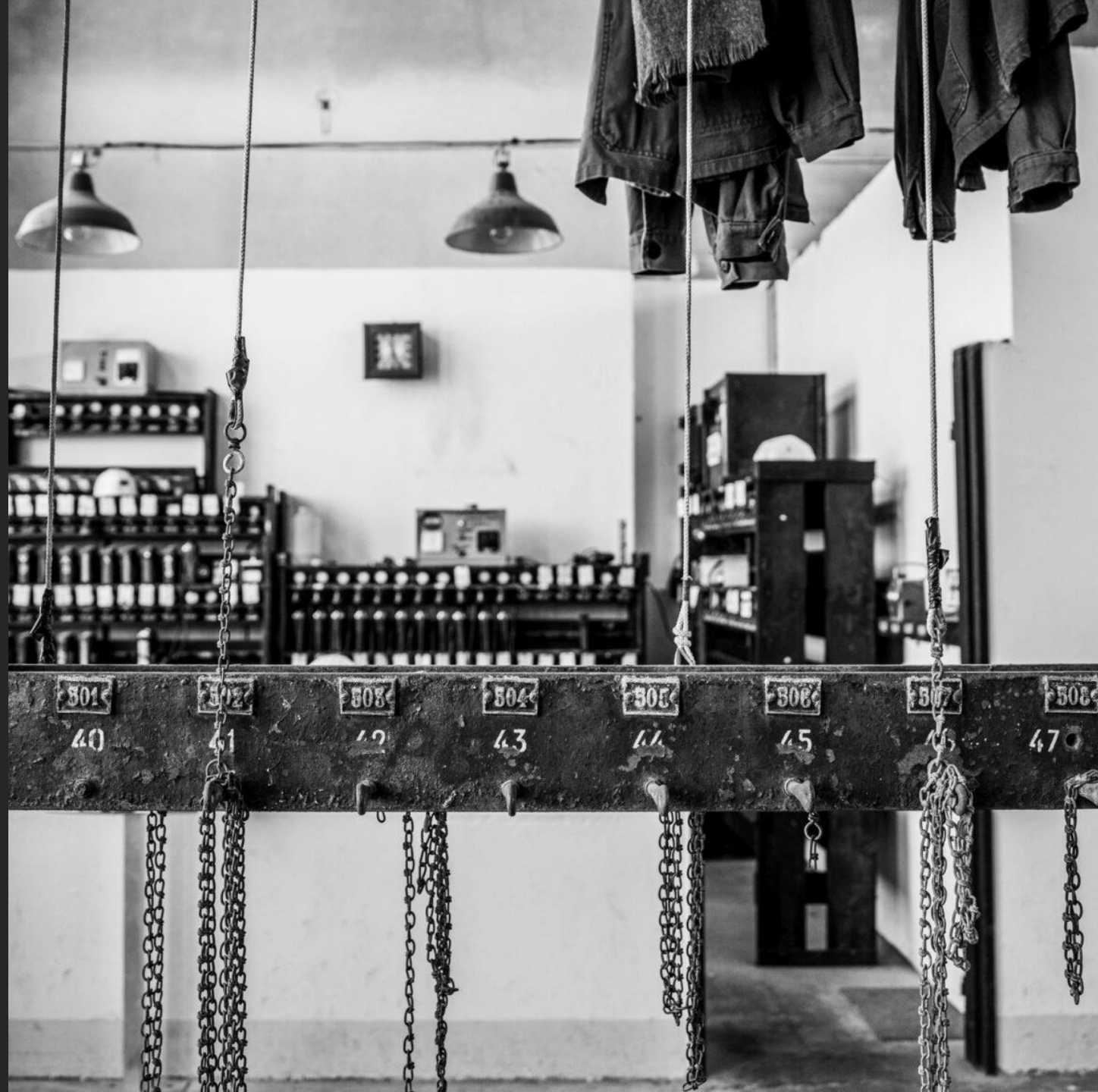
Salle des pendus