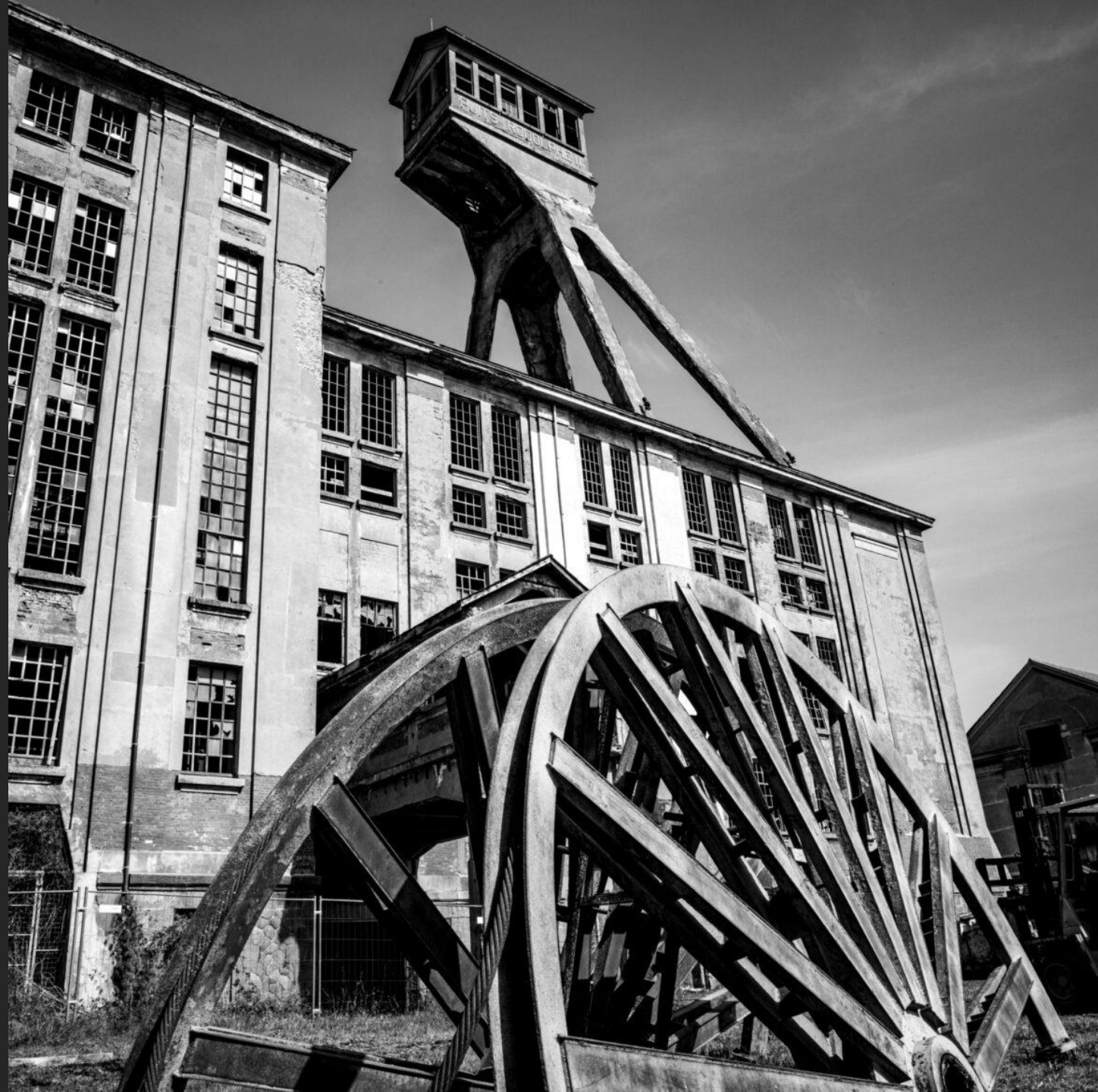
The wheel of industrial time