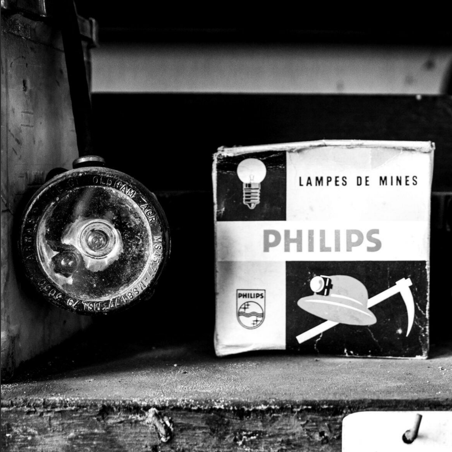
Miner's best friend